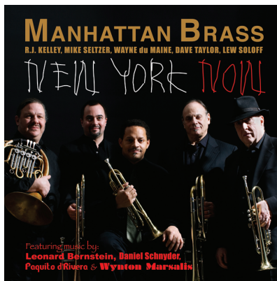
New York Now, 2010