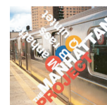
The Manhattan Project, 2001