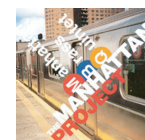
The Manhattan Project, 2001