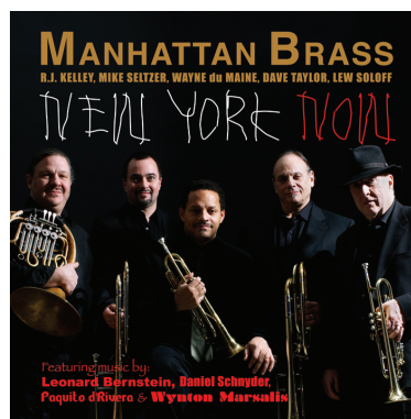
New York Now, 2010